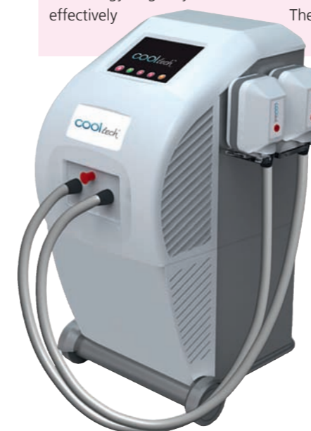
The INDEX magazine April 2013 www.indexmagazine.co.uk

• For information, contact Dr Rita Rakus Clinic, 34 Hans Road London, call 0207 460 7324 or visit www.driritarakus.com